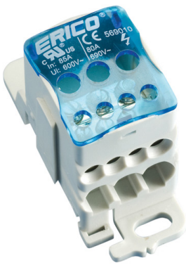
Single Pole Distribution Blocks

ERIFLEX offers a wide selection of compact halogen free single pole, two pole, and four pole distribution blocks and a complete range of assembly support products for easy fastening to DIN rails or steel sheet. The blocks offer easy assembly with visual inspection to allow for confirmation of connections to a wide range of conductors including ERIFLEX FLEXIBAR and IBSB/IBSBR. The high fill ratio ensures optimal electrical connectivity even in tight assemblies.