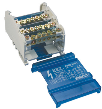
Four Pole Distribution Blocks